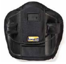
Jay Zip Back