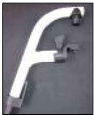
Aluminium hanger 70°/80°