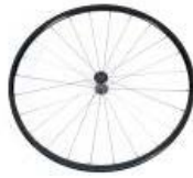
Rear wheel, Lightweight, 24 spokes, straight spokes