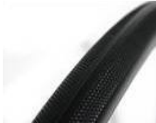
Tyre, puncture proof, tread