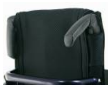
Push handles, fold-down