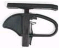
Single post height adjustable