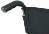
Push handles long