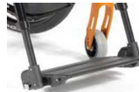
Footboard, platform, aluminium, angle-adjustable, flip-up (sideways), heel loop, black