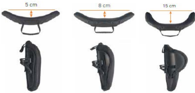
Jay 3 Back Shallow Contour