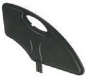
Plastic sideguard, removable (black)