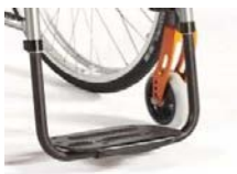
Footboard, platform, lightweight, plastic, angle and depth-adjustable, calf strap, black