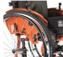
Push to lock brake, integrated in sideguard, Safari