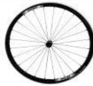
Rear wheel, Proton, 24 spokes, straight spokes