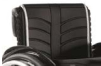
EXO backrest sling