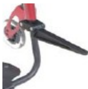
Caddy, flip-up bracket for bags