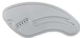
Aluminium sideguard, wet weather protection (in frame colour)