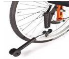
Anti-tip tubes, swing-away, left