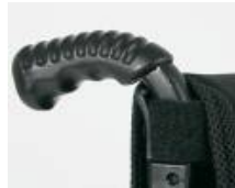
Push handles short