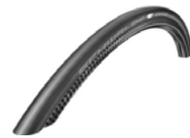
Tyre, pneumatic, slick, Schwalbe One