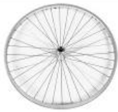
Rear wheel, Design, 36 spokes, straight spokes