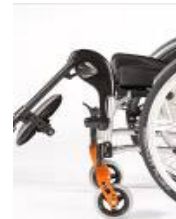
Elevating legrest (ELR)