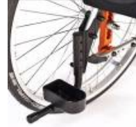
Crutch holder, loop