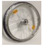
Rear wheel, drum brakes, 36 spokes, cross-wise spokes