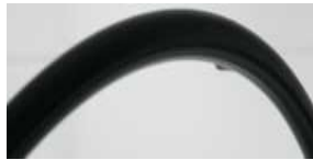
Handrims, Maxgrepp ®