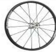
Rear wheel, Spinergy, 18 spokes (black), straight spokes; hub: silver