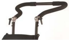
Push bar, height- adjustable, width and angle- adjustable