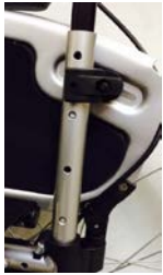
Backrest tube, aluminium Life T