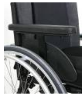
Single-post sideguard, armpad, height-adjustable, removable