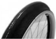
Handrims, Supergrip ®