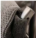
Without push handles,