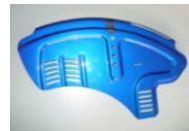
Aluminium sideguard, fender, wet weather protection (in frame colour)