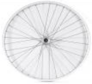
Rear wheel, Universal, 36 spokes, cross-wise spokes