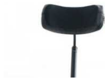
Headrest, height, depth and angle adjustable