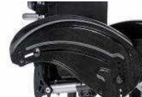
Carbon fibre sideguard, fender, wet weather protection (black)