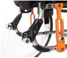
Wheelbase extension for add-on bike