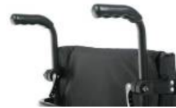
Push handles, height-adjustable