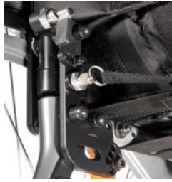
Backrest, angle adjustable