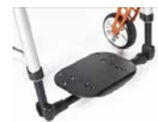
Footboard, platform, lightweight, plastic, angle & depth-adjustable flip up (sideways), calf strap