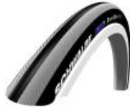
Tyre, pneumatic, fine profile, Schwalbe Right Run