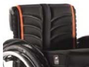
EXO PRO backrest sling