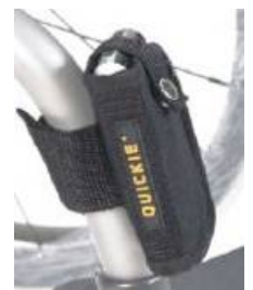
Mobile phone pocket