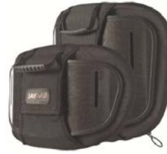
Jay 3 Carbon Back Shallow Contour